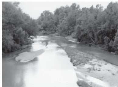
The Comite River is designated as a Louisiana scenic river

Greenlinks preserve natural areas, conserve plant and wildlife habitats, increase the aesthetic and property value of the area they serve, and reduce automobile use by providing a commuting alternative, thereby reducing traffic and air pollution. River and creek banks, drainage servitudes,